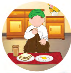
Ali eats breakfast.